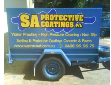
Latest Addition to the fleet — 8 x 4.5 ft custom manufactured application trailer